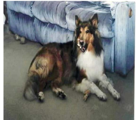
Here's Molly in her new home, engaged in one of her favorite activities, chewing rawhide bones.