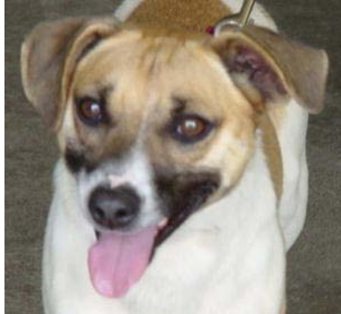
Skipper was recently adopted by a wonderful family after recovering from his treatment.

Donations for the Molly Medical Fund can be sent to the Stephen Memorial Animal Shelter, 2299 235th Street, Oskaloosa, IA, 52577. Thank You!