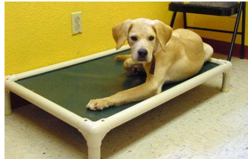
Levi enjoys relaxing in style.